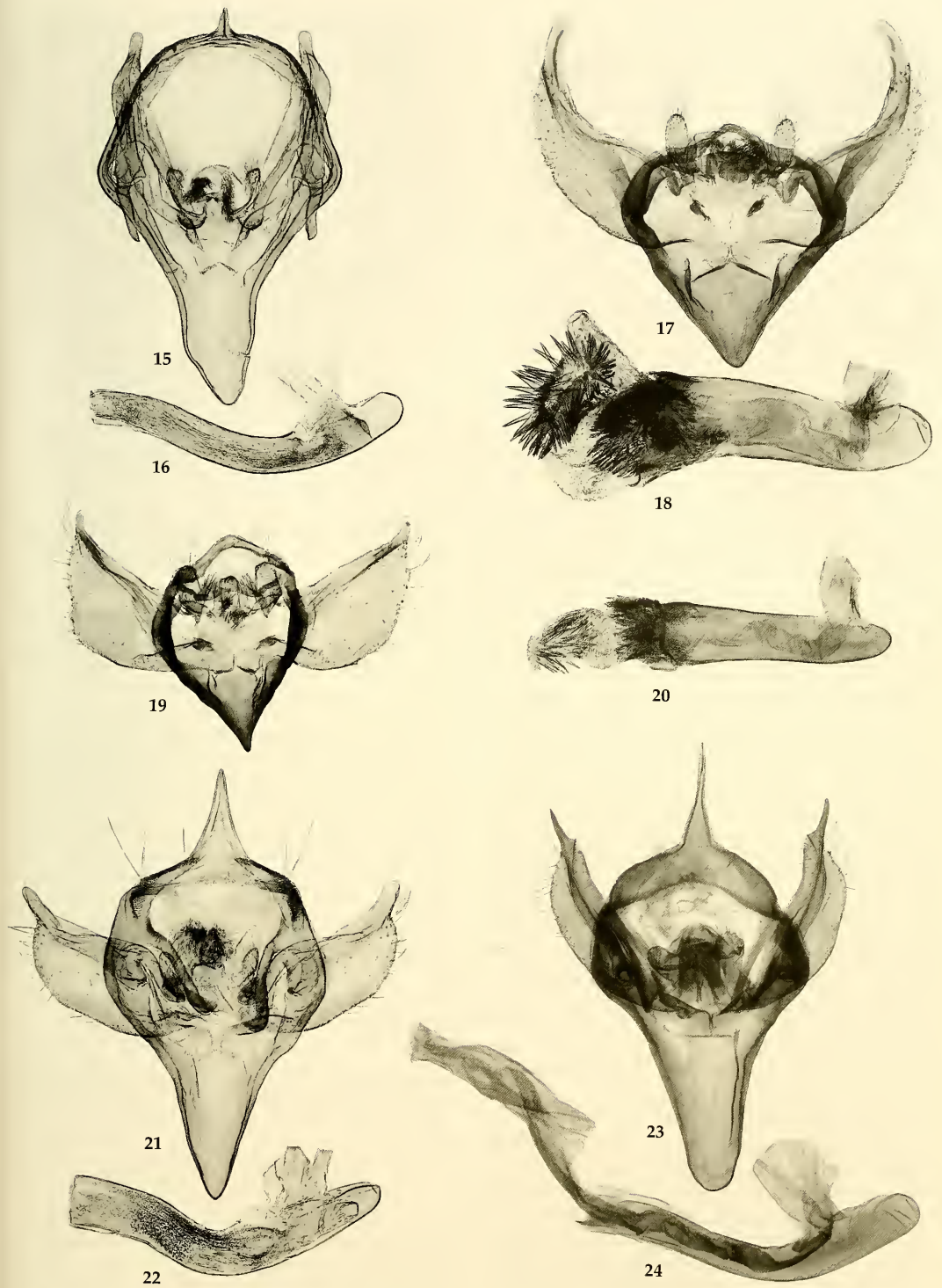
Figs 15-24. Visiana spp., male genitalia. 15,17,19,21,23: armature, 16,18,20,22,24: aedeagus. 15-16. V. sordidata . 17-18. V. inimica . 19-20. V. tamborica . 21-22. V. hollowayi , spec. nov. 23-24. V. robinsoni .